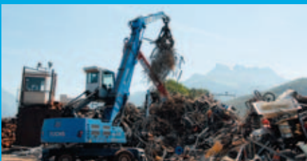
Trottet Récupération SA in Collombey-le-Grand/VS