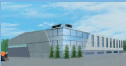
The new headquarters of the Group in Ecublens end of 2009

One of the main recycling groups in Switzerland