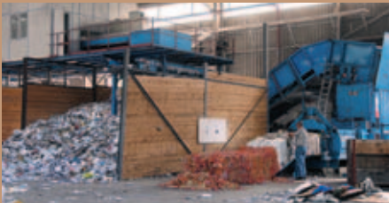
Papirec SA in Moudon/VD