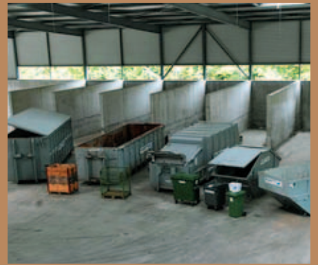
Storage containers for waste paper collection