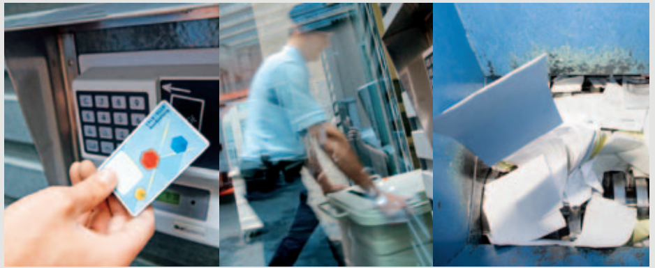
Confidential papers are ground in secured plants accessible only to accredited employees wearing a badge.