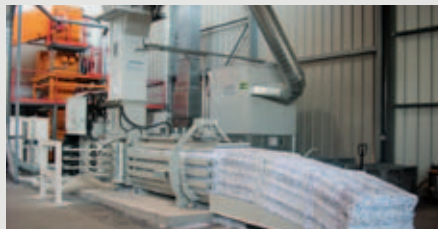
Datarec AG in Satigny/GE since 2009