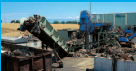
Abbé SA in Satigny/GE: 800 ton hydraulic scrap shear