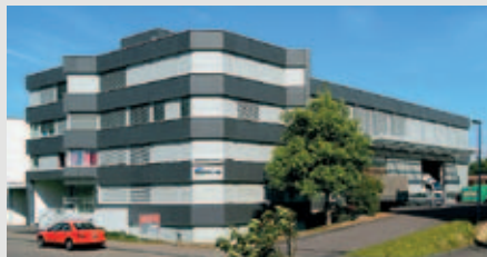
Datarec AG in Spreitenbach