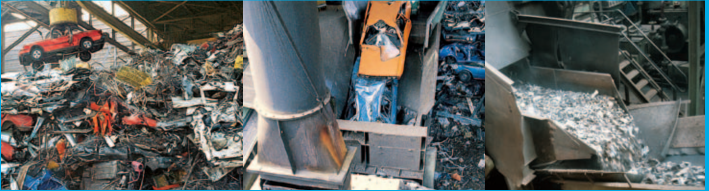
A car crushing facility, the only of its kind in French-speaking Switzerland...