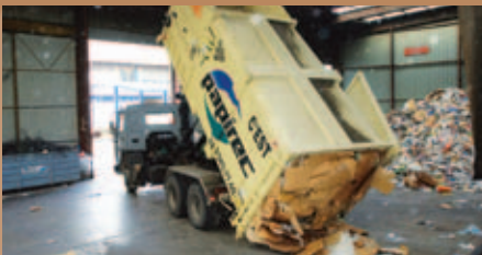
Papirec SA in Carouge/GE