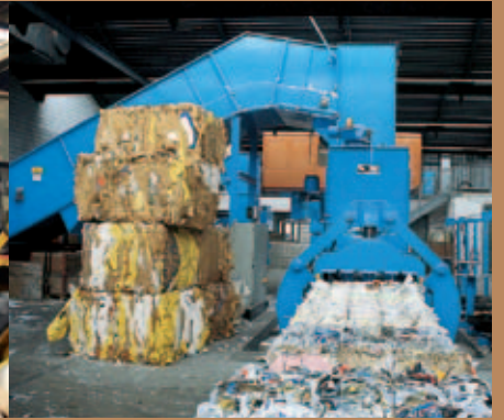
Every day, hundreds of tons of waste paper are brought from the local towns