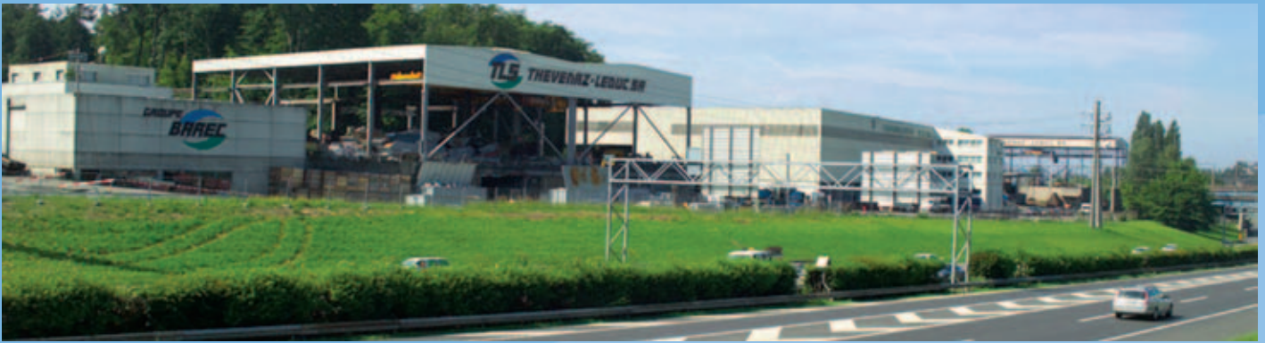
Ecublens-based Thévenaz-Leduc SA / Sirec SA, the parent company